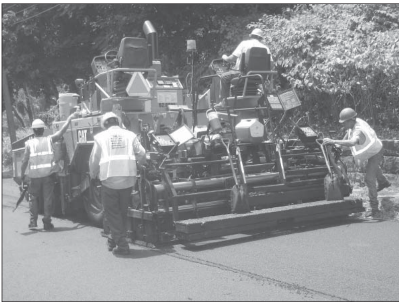
Crews repaved Walnut Street on July 30.